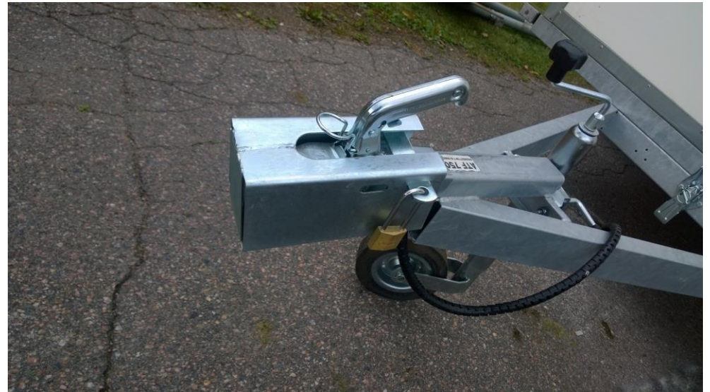
Picture 2. Attaching the trailer to the towing hitch